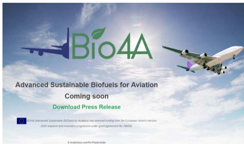
Figure 3. Website homepage

BIO4A website ( http://www.bio4a.eu/ ) is one among the most strategic communication and dissemination means of the project.