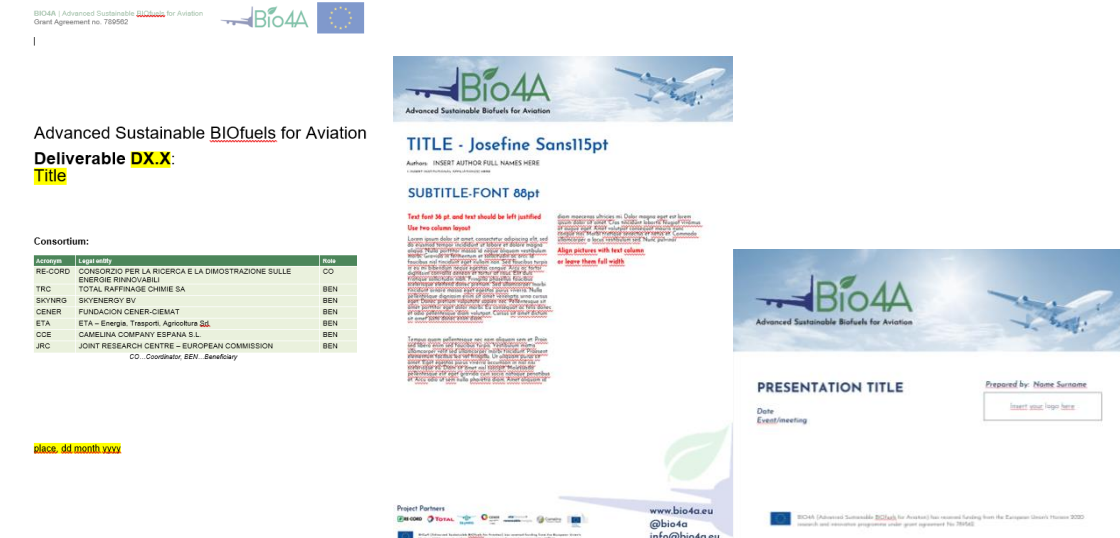
Figure 2: samples of project templates

Also, the font Josefin-Sans, specifically chosen for PowerPoint materials, has been included in the materials shared among partners.